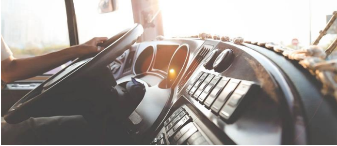
AAMVA Training and Reports for Members