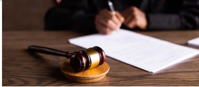
Cross Reference for 49 CFR, Parts 383 and 384